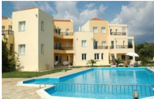
Xifoupolis Hotel (with pool) http://www.xifoupolis.com/

Studios & Apartments is ideal for families with a pool. 4 studios (for 2-3 persons) and 7 family apartments for 4 or 5 persons. Suitable for groups (up to 47 people). Located at Xifias area, 5 km south of Monemvasia, close to the best beaches of the area and some very good greek taverns. Offers buffet breakfast with homemade delicacies and features a restaurant of greek traditional dishes made of their own products. Possibility of half board. Free private parking.