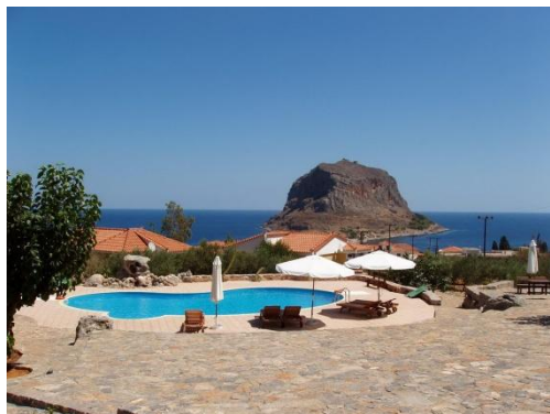
Monemvasia Village (ex Topalti Village) (with pool) http://www.topalti.gr/main_en.html

Studios & Apartments is ideal for families with a pool. 4 studios (for 2-3 persons) and 7 family apartments for 4 or 5 persons. Suitable for groups (up to 47 people). Located at Xifias area, 5 km south of Monemvasia, close to the best beaches of the area and some very good greek taverns. Offers buffet breakfast with homemade delicacies and features a restaurant of greek traditional dishes made of their own products. Possibility of half board. Free private parking.