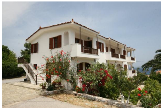
Venetia Apartments http://www.venetia-apartments.com/

Independent Studios & Family Bungalows is ideal for families and couples, looking for privacy and quiet accommodation. It has a pool. 8 Studios (for 2-3 persons) and 4 Family Bungalows with separate bedroom for 4 or 5 persons. It is located uphill in Gefyra, New town of Monemvasia offering one of the best views of the rock and the new town. It doesn't offer breakfast. Free private parking.